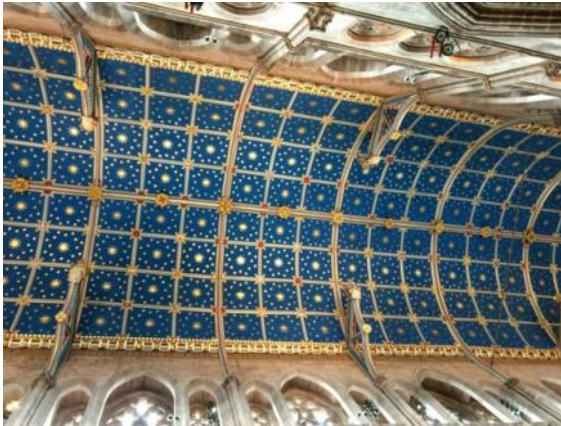
Carlisle Cathedral Chancel roof.

Whatever the reason for its construction, I discovered at Carlisle that Holy Trinity and Carlisle Cathedral have one feature in common: the ceiling of both chancels is painted in a similar fashion being gold stars on a dark blue background. I was so struck by this similarity that I took photos of both of them. When I am sitting in the choir at Holy Trinity I often look at the ceiling and so I felt very at home in the Cathedral. Of course, many churches may have chancel ceilings painted like this, but I like to think that ours was influenced by the one which would have been familiar to the three sisters. Fanciful perhaps, but I rather like the idea.