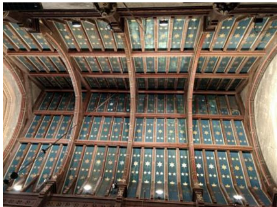
Holy Trinity Chancel roof